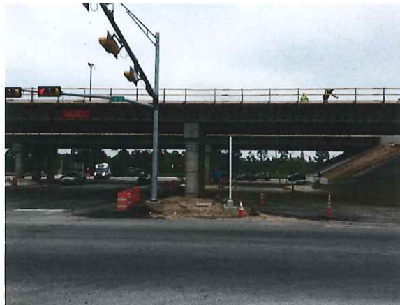
LOOKING NORTH (TOWARD BASTROP STATE PARK)