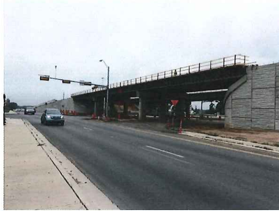
LOOKING WEST (TOWARD BASTROP)