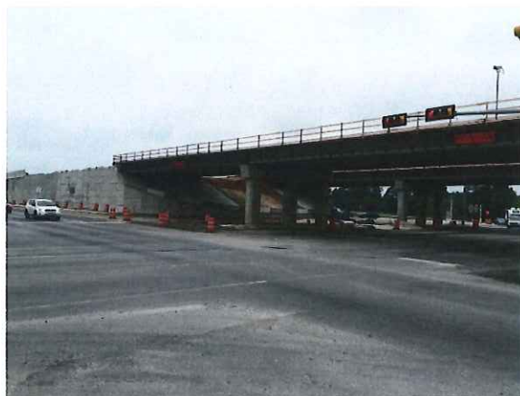
LOOKING WEST (TOWARD BASTROP)

Overall, the project is over 80% complete and is currently well ahead of schedule. In the coming weeks, the contractor will continue installing bridge deck